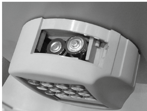
Batterien / Batteries / Batterijen: 2x 1,5V Mignon (LR6)