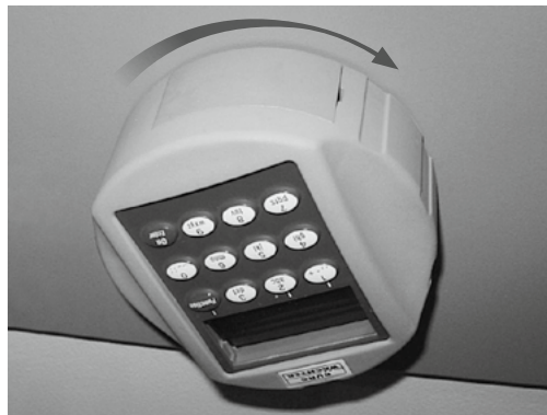
Codeeingabe / Code entry / Entrée code / Code invoer